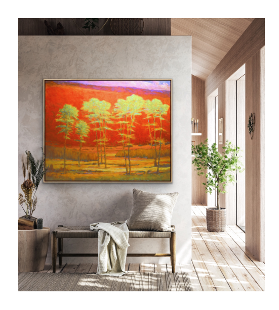
Gathering Light III oil on canvas 48 x 60 inches