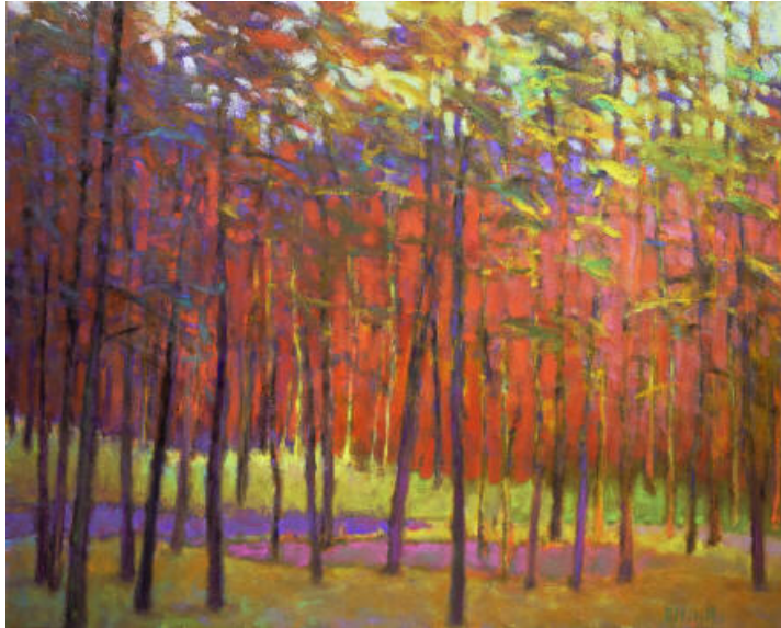
Ken Elliott Forest Surprise oil on canvas 40 x 50 in.